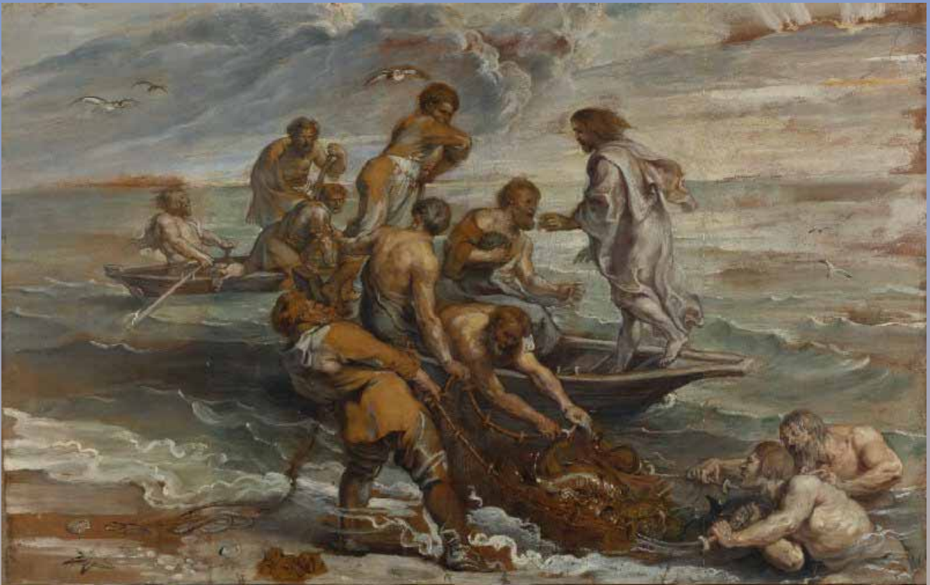
The Miraculous Draught of Fishes Peter Paul Rubens 1618-19

Praying through the Sacraments, Learning through Religious Education, Caring through Pastoral Care.