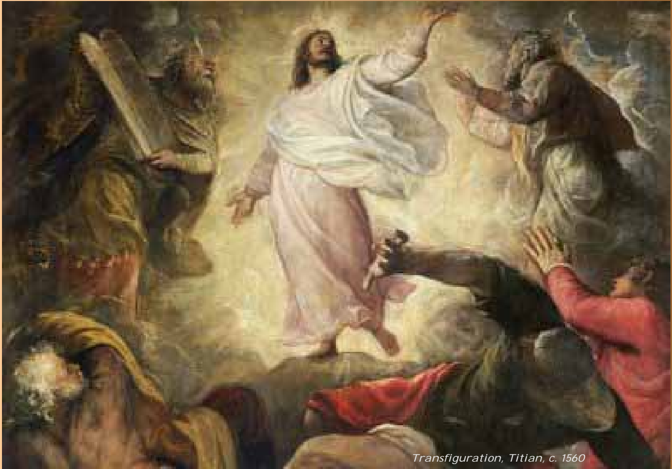
Transfiguration, Titian, c. 1560

Praying through the Sacraments, Learning through Religious Education, Caring through Pastoral Care.