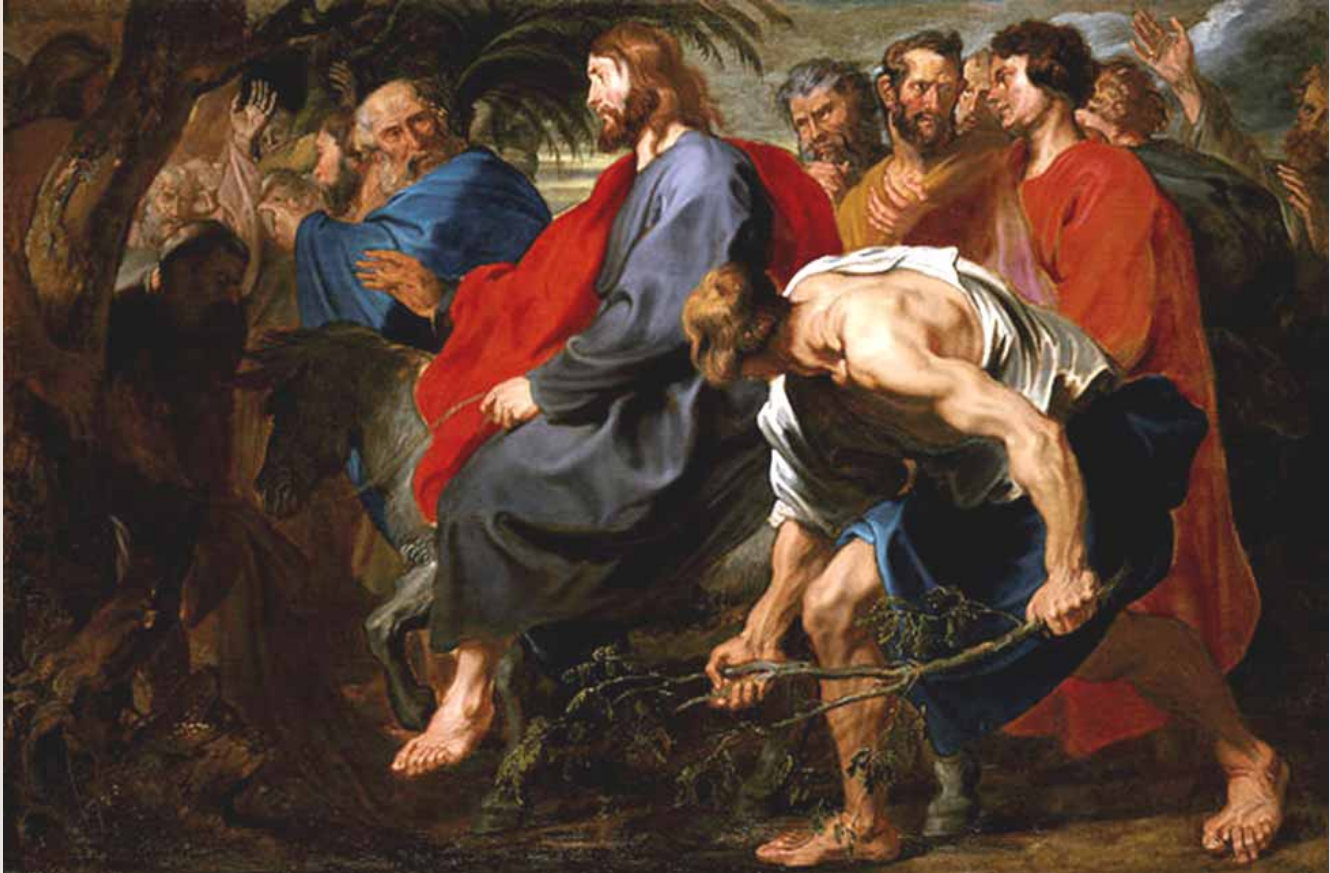
Entry of Christ into Jerusalem ,Anthony van Dyck ,1617

We are a praying, learning and caring community fulfilling the mission God gives us in baptism by our worship in faith, by our witness in hope and by our service in love.