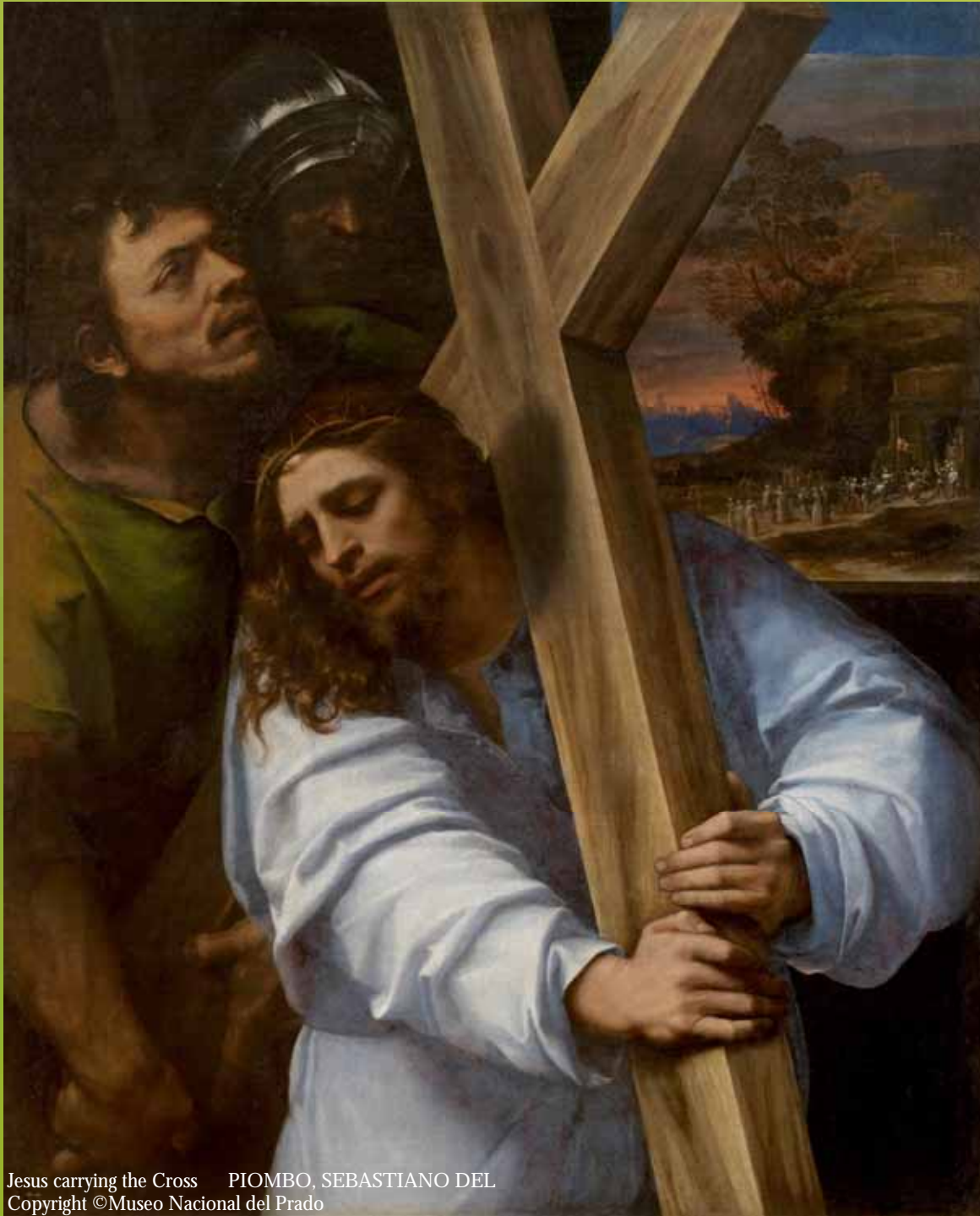
Jesus carrying the Cross PIOMBO, SEBASTIANO DEL

Twenty-Third Sunday in Ordinary Time September 8th, 2019